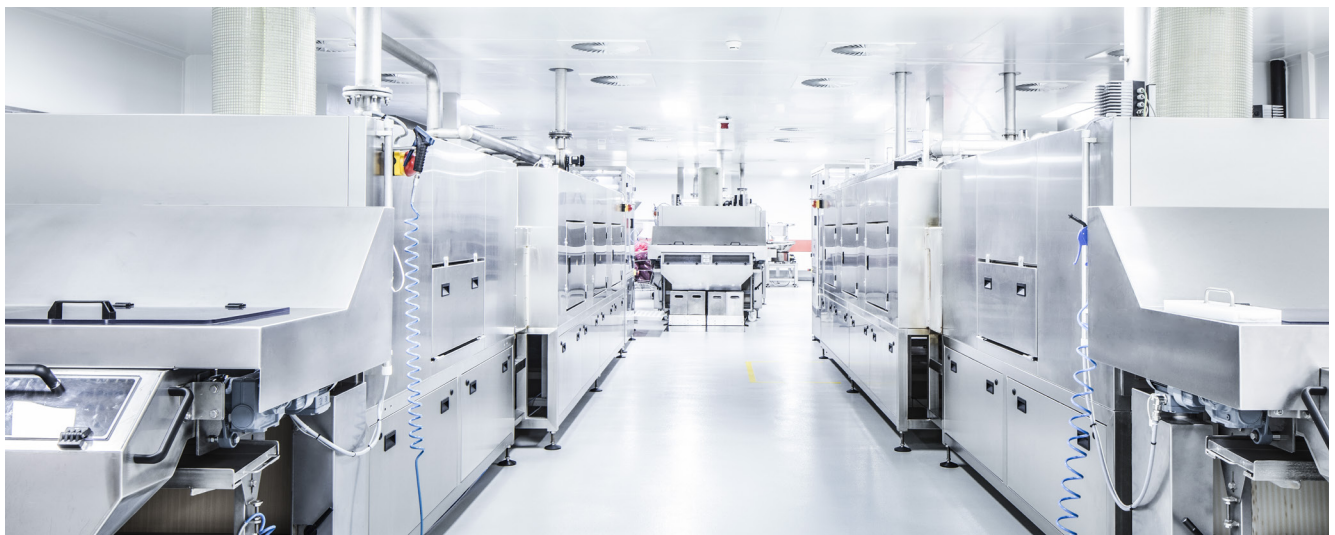
All coated products are manufactured in facilities across three continents that operate under Datwyler's FirstLine® standard.

Datwyler's coating technology is a proprietary fluoropolymer coating providing full coverage of the entire product and eliminating the need for siliconization. It forms a strong barrier between the elastomer component and the drug, thus providing a superior protection against extractables. The coating has a strong repellent effect against any aqueous solutions, further minimizing the possibility for potential interactions.