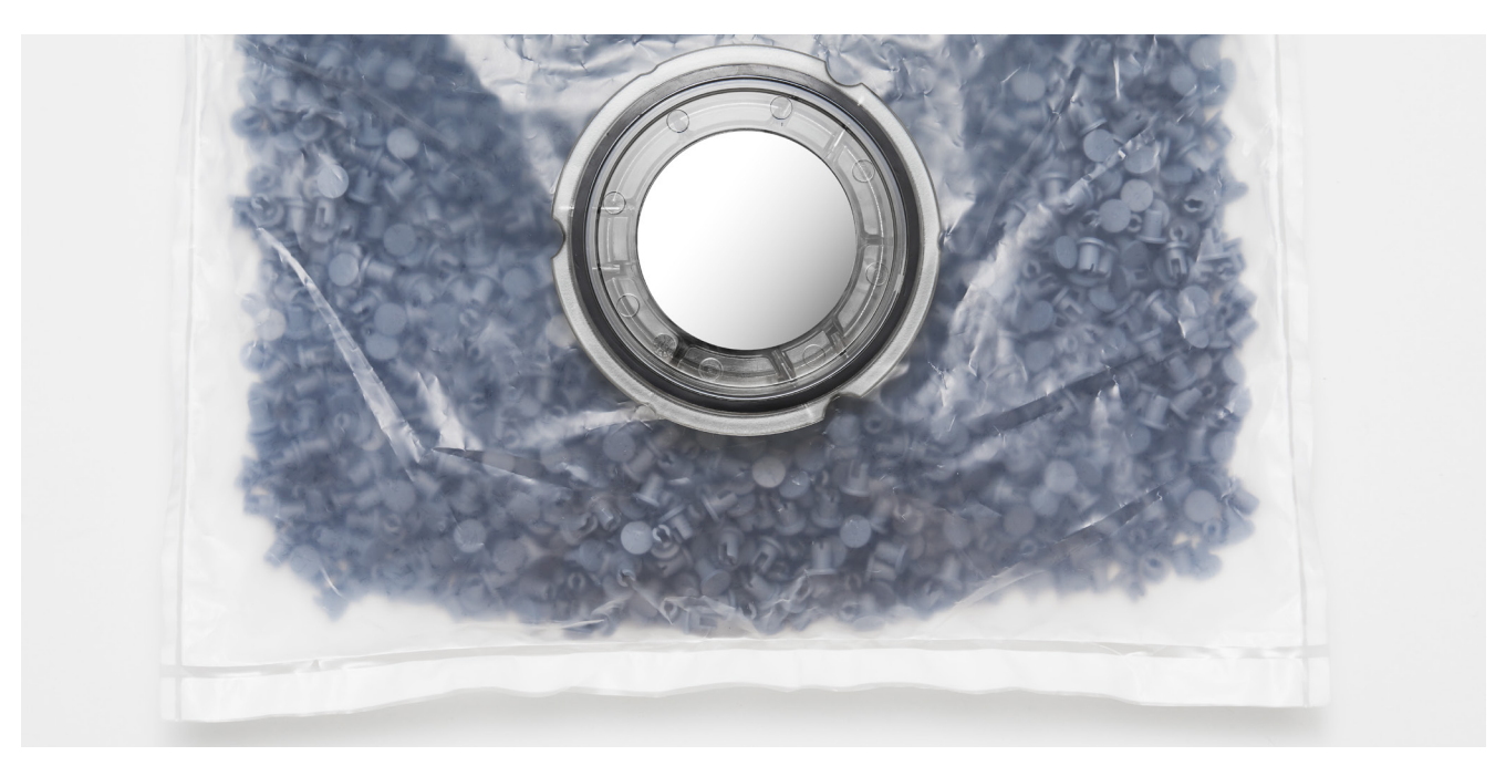
Datwyler has applied its expertise in RFS solutions to a platform of RTU components that minimize human intervention in the component transfer process. The company takes full responsibility and ownership of the sterilization of the products prior to their shipment.

Answering the evolving requirements of pharmaceutical filling operations and more stringent regulatory guidelines, RTU products are also available in combination with Rapid Transfer Port (RTP). By minimizing human intervention in the component transfer process, the risk of contamination is significantly reduced. In addition, the operational efficiency gets increased by facilitating routine operations.