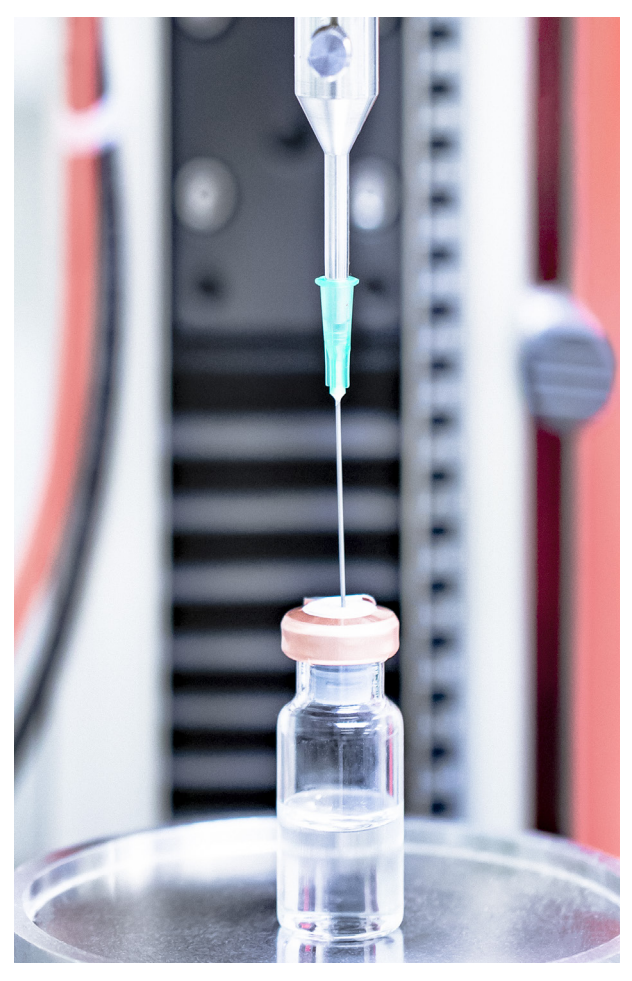
Datwyler's products are compatible with all standard sterilization methods on the market.